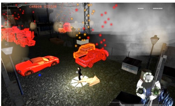
Carbon Vision to 'see' carbon and build awareness of low-carbon alternatives