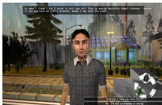
Player interacting with a non-player character (NPC) to learn about renewable energy